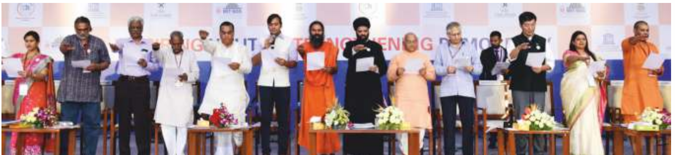
Yog Guru Swami Ramdev Administering Oath of "Strengthening Democracy" at 7 th Bharatiya Chhatra Sansad