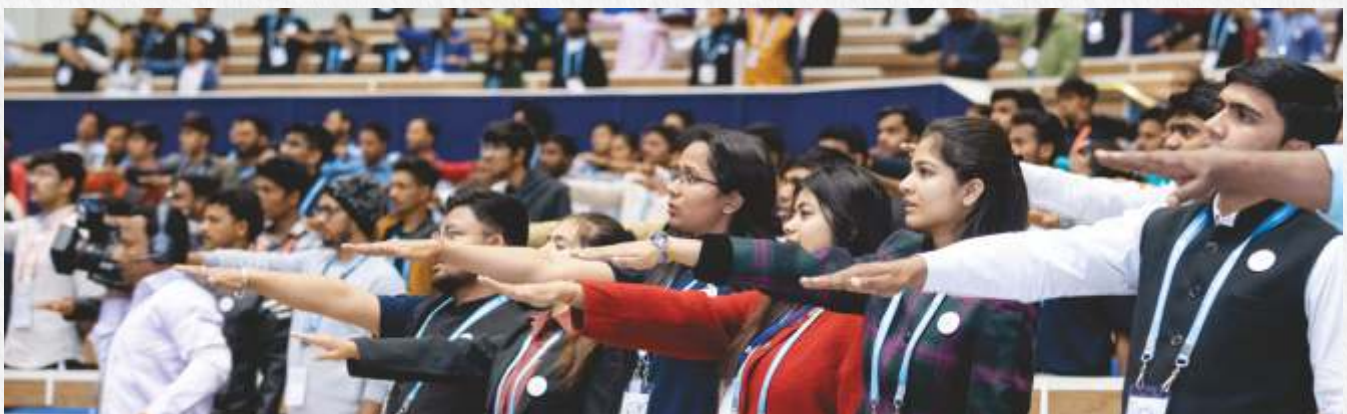
The sequence of above photographs is randomly arranged.