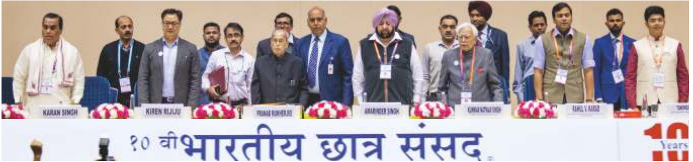
Paying respect to and reciting the National Anthem, at 10 th BCS